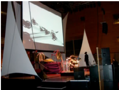
Fig.8: This system is applied to a music theater work. There is a 3D image (by Yann Bertrand) behind RoboticMusic.