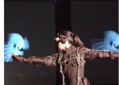
Fig.2: BodySuit can also control sounds and video images in real time.

Another point is the method of translation used by the computer. For example, signals from “BodySuit” are transformed by Mapping Interface and Algorithm in a computer, and then are sent to “RoboticMusic.” One gesture may trigger one attack on one instrument. However, it is also possible to trigger 5 instruments at the same time. Otherwise complex musical data, which is automatically generated by a computer and then reproduced by “RoboticMusic,” is altered by gestures with “BodySuit” to modify the parameters of algorithm in real time.