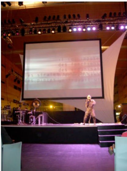
Fig.1: A performance with "BodySuit" and "RoboticMusic". A photo from its rehearsal.