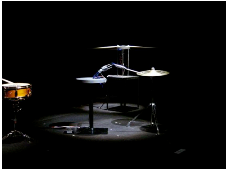
Fig.4: Pipe Robot appears behind the Cymbal Robot on this photo. Pipe robot changes the pitches according to the speed of spins.