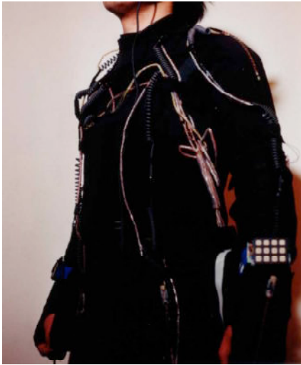
Fig.6: Upper half of body with BodySuit. The 12 bending sensors are placed on each joint of body.

“BodySuit” has 12 sensors, which are placed on each joint of the body, such as a wrist, an elbow, a shoulder on the left and right arm an ankle, a knee, and the beginning of the left leg and right leg. The bending sensors are placed on the outer sides of the arms and on the front sides of the legs and fixed on a suit. Each sensor is connected with a cable to a box, and then it is connected with A/D interface.