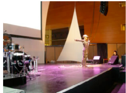
Fig.7: The performance of “Augmented Body and Virtual Body” in Nantes, France, in November 2005.

Since this is done in stage work, the fact, “gesture vs. gesture” should be much considered. The gesture with “BodySuit,” which doesn’t emit any sound by itself, is related with the gesture with “RoboticMusic,” which is intended to create sound. In terms of interaction, the visual aspect between one gesture and another gesture provides clearer feedback and brings a different and interesting dimension. Incidentally, this communication does not refer to the one between the first person to another. In this case, the communication means the point of view from a third person to observe this relationship objectively.