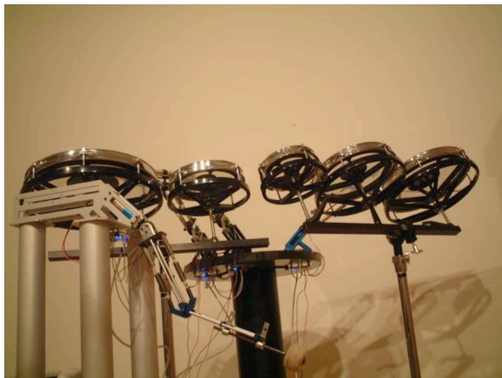
Fig.5: There is a special sort of springs in the arm of the robot. At the end of this, it holds a mallet.

One of robots plays numerous pipes, and rapidly spins to create Flute-like sounds, which are generated while the air goes through them. These pipes are different lengths according to the pitches one desires. As it spins faster, the pitches become higher as following an overtone series (Fig.4).